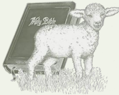
Diagram: Galatians 2:20 with Explanation